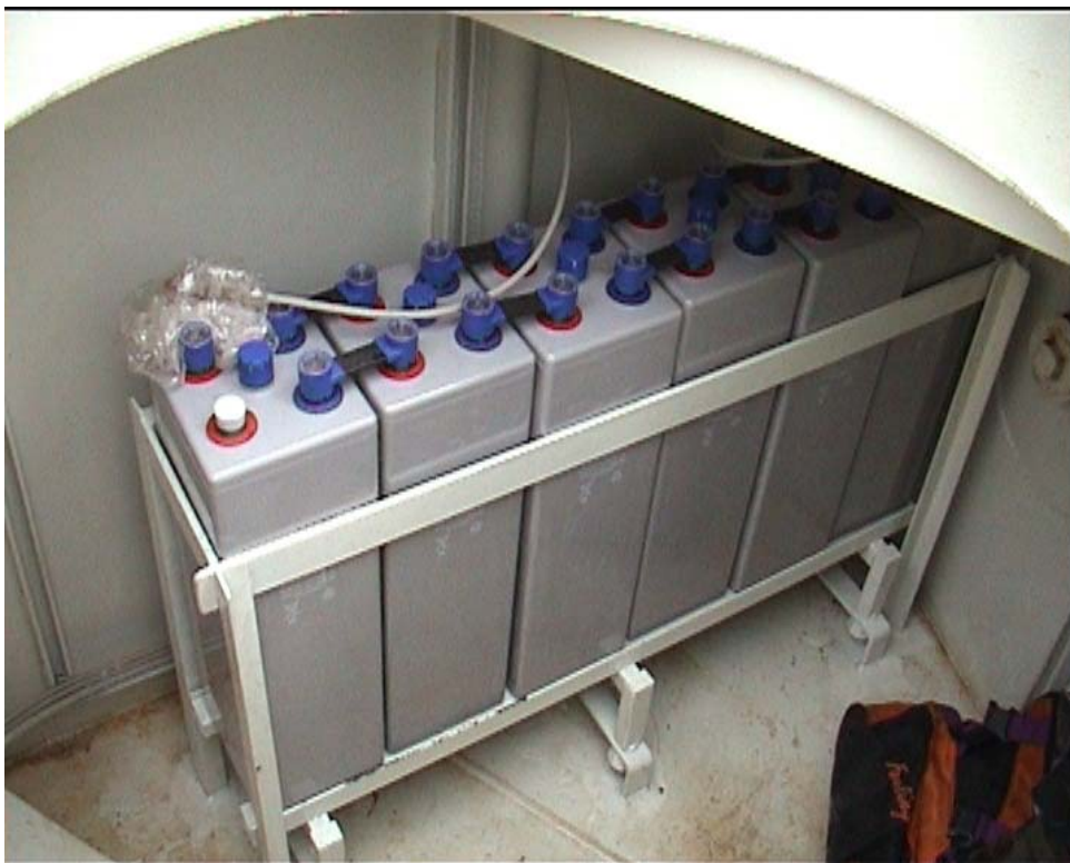
Fig 2.2 –The battery compartment