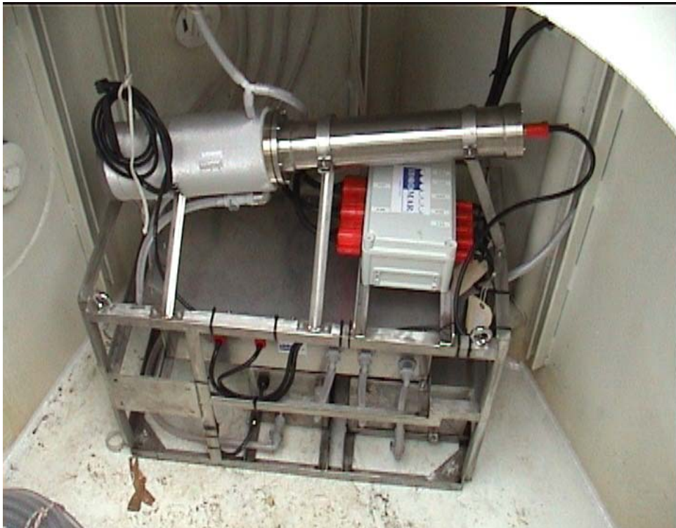
Fig 2.3 –The automatic water pumping and analysis compartment

Access is provided from the deck level to the three equipment compartments by 1-meter diameter openings having watertight covers and a latch to secure the cover when in the open position. There are twenty 14 mm nuts and bolts that secure each cover. The peripheral compartments are sealed to ensure buoyancy of the buoy if all the equipment compartments are flooded. Four of the peripheral compartments have access from the deck and are used as ballast compartments. The ballast compartments have the capacity for 1135 kg (total) of water, which may be used to trim and/or ballast the buoy to the desired displacement as defined by the following information: